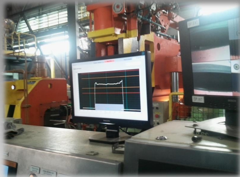
KPI's computation & communication to operator